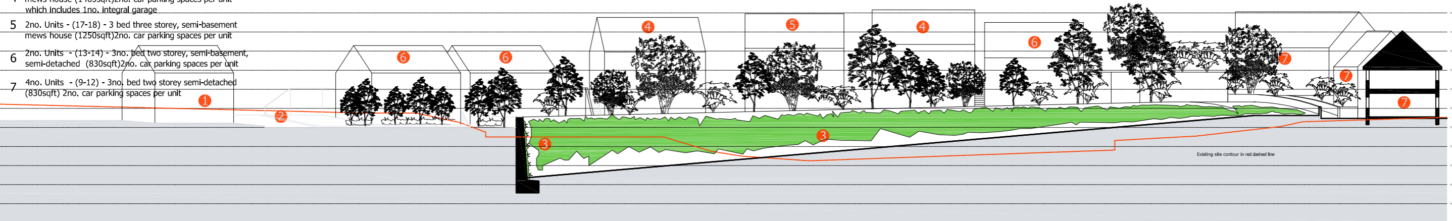
SITE SECTION A-A